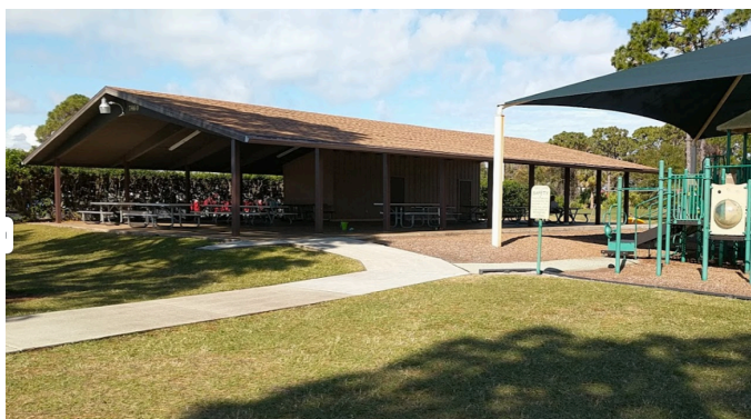
Pavilion at Spyglass Jack Mahon Park